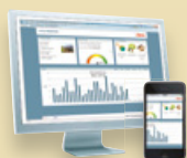
StecaGrid Portal Web portal