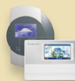
Solar-Log™ and Meteocontrol WEB'log Accessories